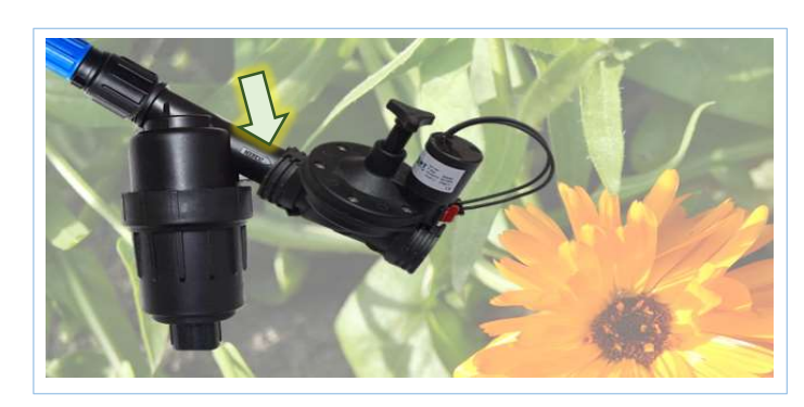
2. Connect Irrigation Valve to Screen Filter in the arrow direction