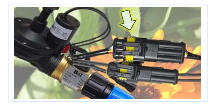
10. Plugin Sensor & Valve Electrical Pins to one end of Wire connecting Controller