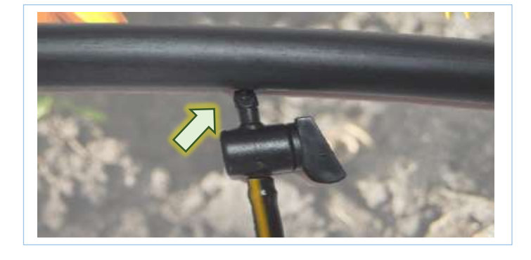
7. Insert 6mm Tap Valve in 16mm line & connect 4mm feeder line to desired length