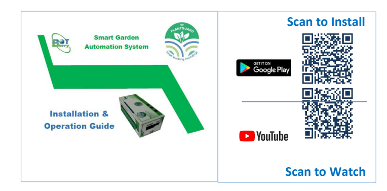
12. Follow the Installation Guide in Controller box for Installation & Watering