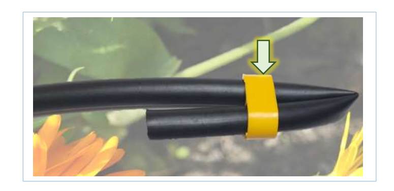
9. Add End Cap at the end of each 16mm Drip line