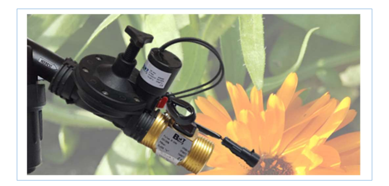
3. Connect the Water Flow Sensor to Irrigation Valve in the arrow direction