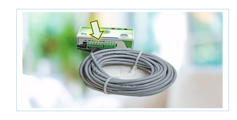
11. Connect other end of Wire with Green Terminal in Controller