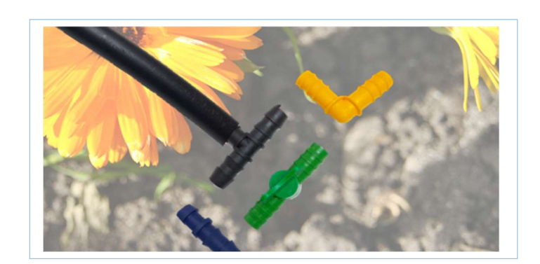
5. Run 16mm Drip line to each row of plants. Add Elbow/Tee/ Tap Valve as required