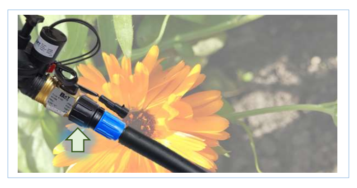
4. Connect "Threaded coupling or GA reducer" to Flow Sensor & attach 16mm